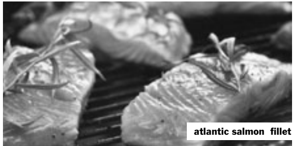
atlantic salmon fillet