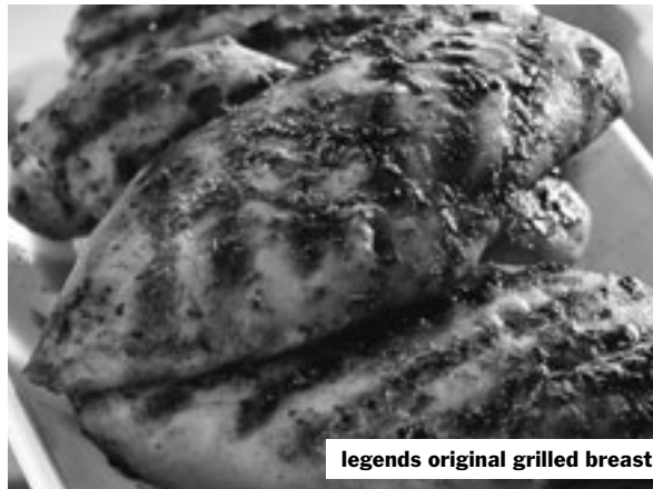
legends original grilled breast