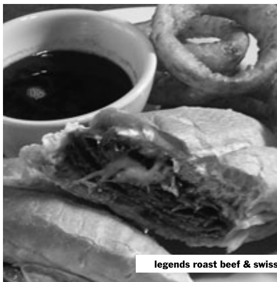
legends roast beef & swiss

Fresh, boneless chicken breast grilled and topped with our teriyaki glaze, melted Swiss cheese and smoked bacon. Served on a toasted bun with red onion rings, lettuce, tomatoes and pickles • 6.99