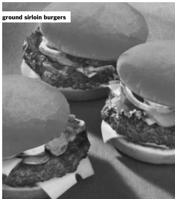
ground sirloin burgers

Consuming raw or undercooked meats, poultry, seafood, shellfish or eggs may increase your risk of foodborne illness.