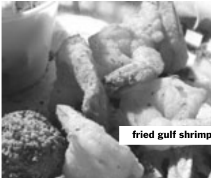
fried gulf shrimp

Enjoy our fiesta fajitas sizzled up with red and green peppers and onions tossed in our special sauce. Offered with lettuce, sour cream and pico de gallo Chicken • 10.99 • Steak • 10.99 • Shrimp • 10.99 Combo of 2 • 10.99 • Combo of 3 • 12.99