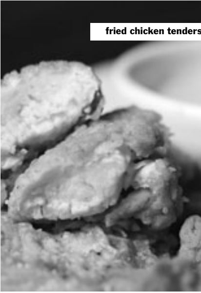
fried chicken tenders

All platters and rib entrées INCLUDE . . .