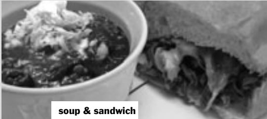
soup & sandwich