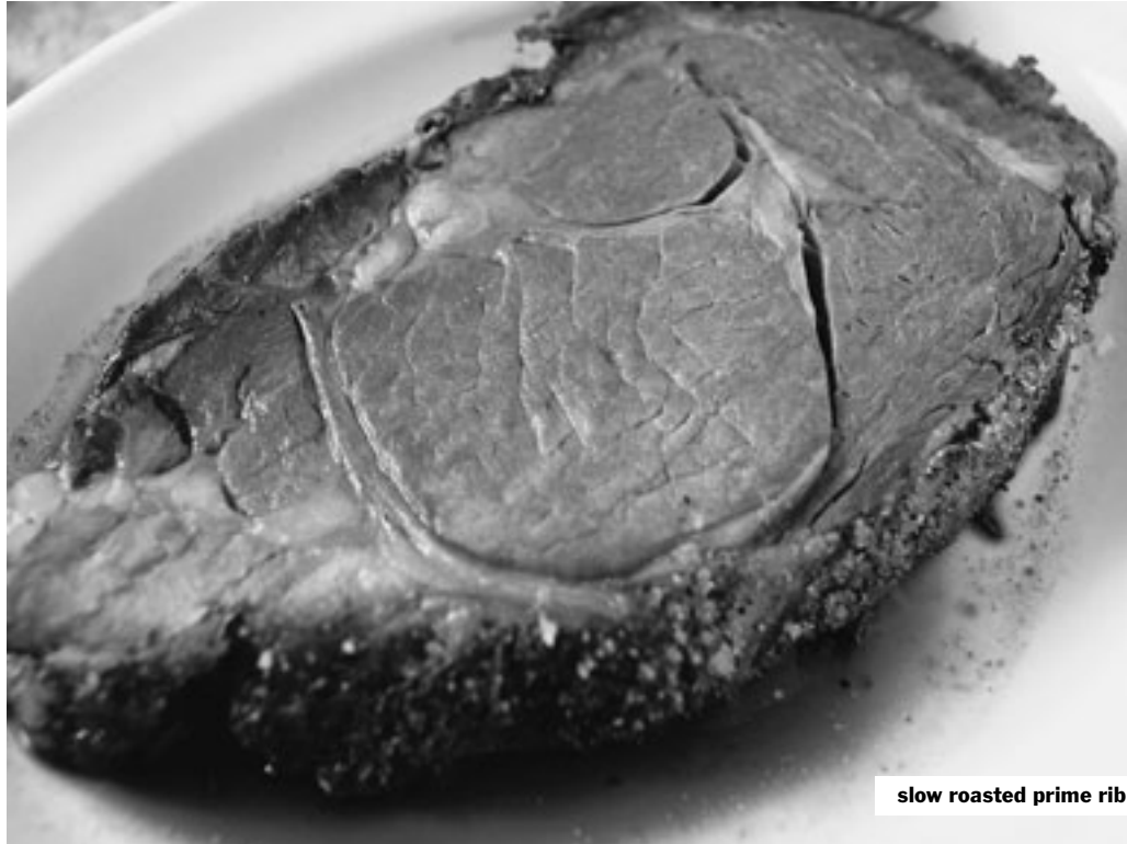
slow roasted prime rib